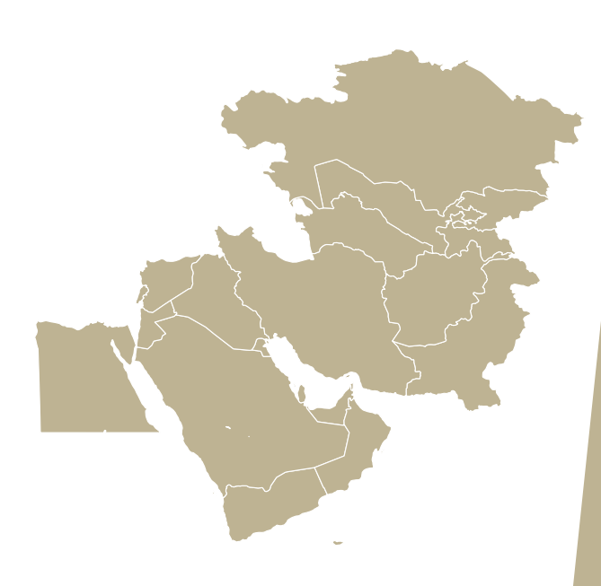
U.S. Central Command Area of Responsibility

U.S. Central Command is one of 10 Department of Defense combatant commands. Each command has a geographic or functional mission that provides command and control of military forces in peace and war. CENTCOM is a geographic combatant command with an area of responsibility that stretches from Northeast Africa across the Middle East to Central and South Asia.