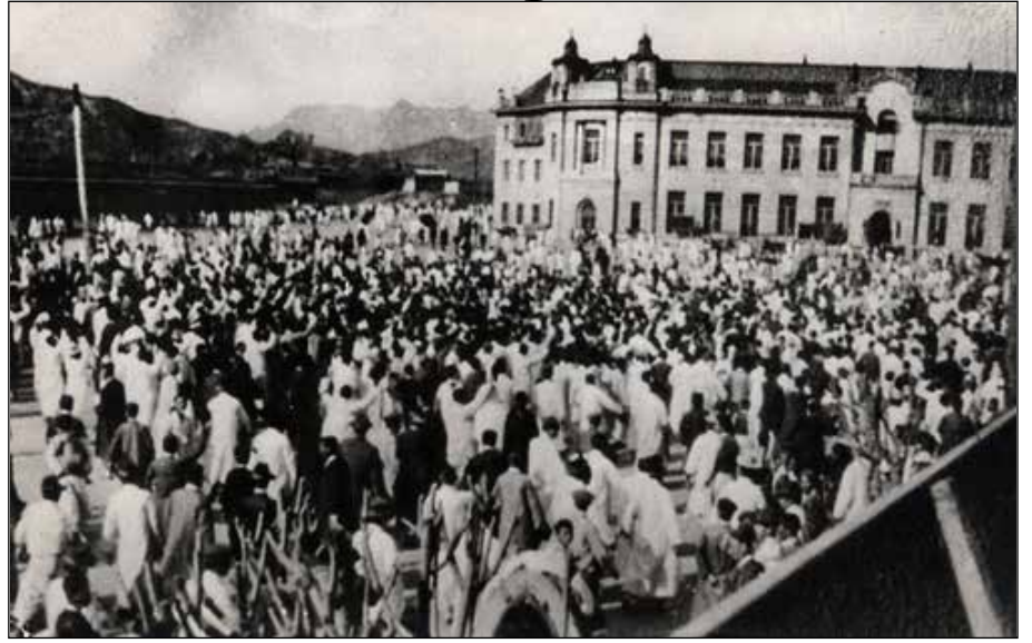
Activists gather around the Taehwagwan Restaurant in Seoul to participate in the March 1st Movement in 1919.

Behind the scenes of movements and demonstrations by fighters for independence, there were many atrocities committed by the Japanese. The Seodaemun Prison History Hall displays historical records of how Koreans were tortured under the justification that Korea was a colony of Japan.