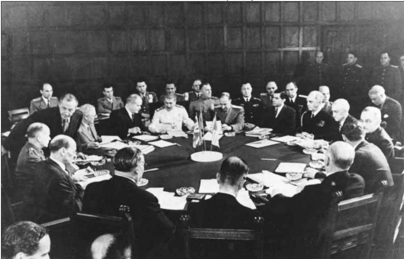
The Potsdam Conference took place in Potsdam from July 17 to August 2, 1945.

While legislating the Act of National Holidays in 1949, Aug. 15 became a national holiday to commemorate Korea's liberation from Japanese colonization. During this particular day, there are numerous commemorative events held across the peninsula. A celebration ceremony takes place at Independence Hall, located in Cheonan, Korea, and is usually attended by the Korean President. Moreover, Korean citizens are strongly encouraged to display the Korean national flag, "Taegukgi," in front of their house or streets. ▴