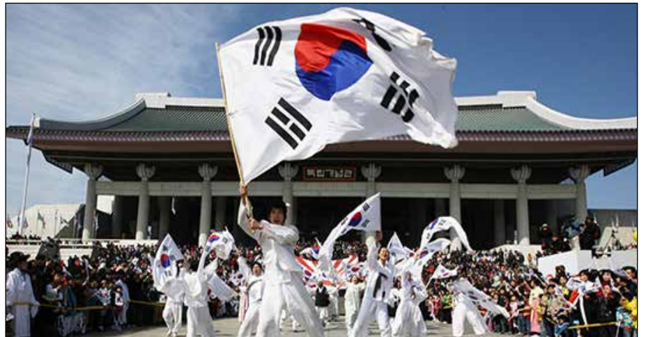
People celebrate Korean National Liberation Day in front of Memorial Hall in Cheonan.

to become sex slaves in 1932, a practice that continued into World War II.