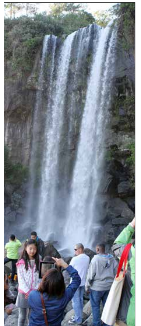
At the foot of the 75-foot-tall Jeongbang Waterfall on the southern coast of South Korea's Jeju Island, visitors pose for photos during a recent Good Neighbor Program visit to the scenic island. The Korean Ministry of National Defense sponsored the tour for members of the U.S. and Korean military and their families.