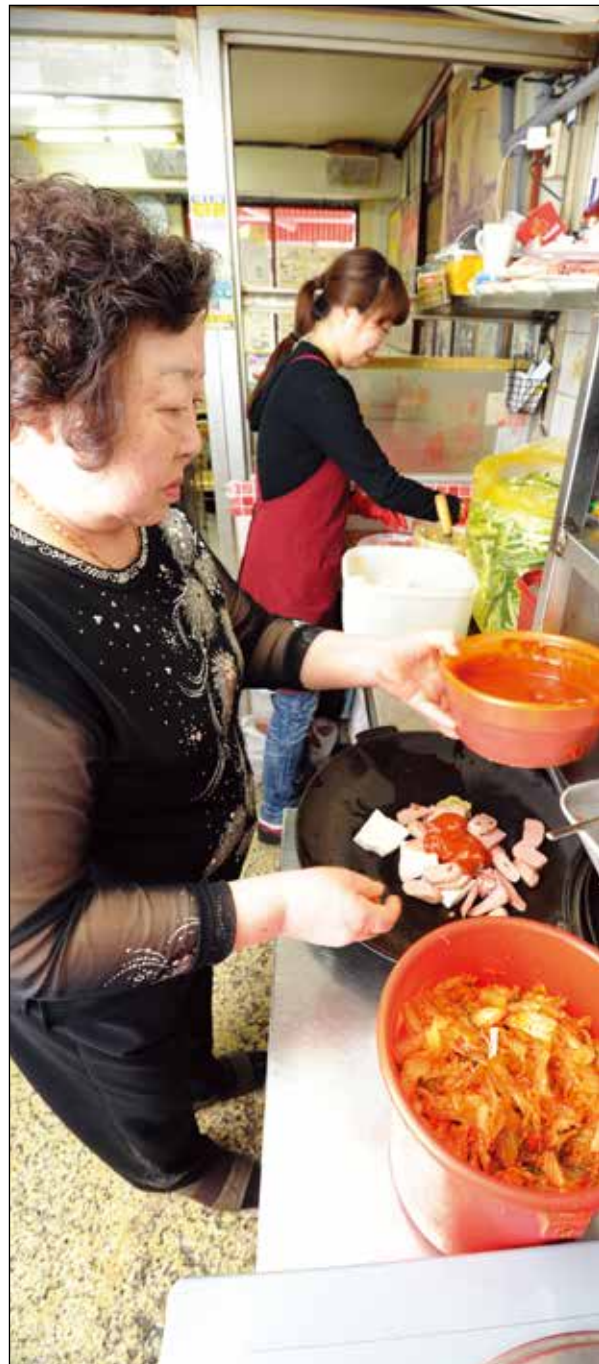
Kitchen staff at Odeng Sikdang restaurant in Uijeongbu assemble the ingredients for budaejjigae, a legacy of the 1950-53 Korean War and aftermath.

Editor's Note: The following article was first published in the Morning Calm edition of April 20, 2012, and is reprinted occasionally for the benefit of our newer readers.