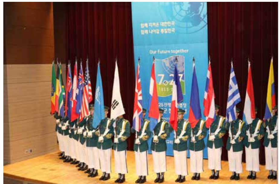
ROK soldiers stand on stage in formation with national flags of the nations that participated in the Korean War during the presentation of colors as a part of the Korean War Armistice and UN Forces participation day commemoration ceremony that took place at the Ministry of Patriots and Veterans Affairs Daegu branch, July 27.