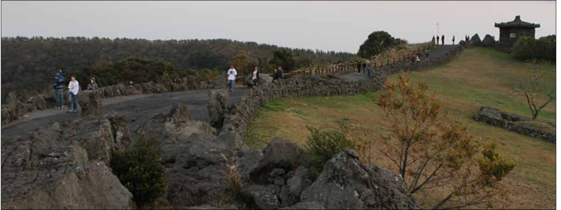
U.S. and South Korean servicemembers and spouses walk along the edge of San-Gumburi volcanic crater during a recent Good Neighbor Program trip to Jeju Island, one of the country's foremost vacation resorts. The Korean Ministry of National Defense hosted their visit.