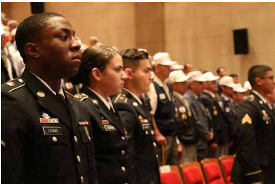
Soldiers from the 19th Expeditionary Sustainment Command attended the Korean War Armistice and UN Forces participation day commemoration ceremony in order to show appreciation to the Korean War veterans. The ceremony took place at the Ministry of Patriots and Veterans Affairs Daegu branch, July 27.

The 19th ESC will now reiterate to all its members, the lessons learned from the past in order to render respect to the ROK-U.S. alliance while reaffirming its strength. ▲