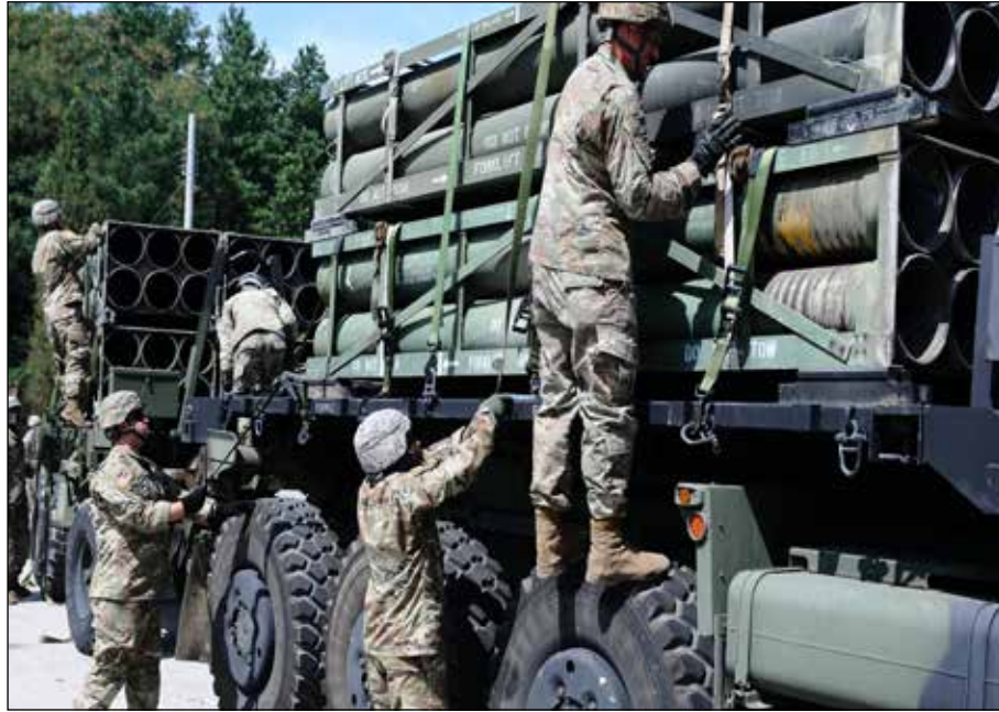
Soldiers with 210th Field Artillery Brigade, 2nd Infantry Division/ROK-US Combined Division unstrap Multiple Launch Rocket System training pods during a loading exercise at Camp Kwangsari in Yangju, Aug. 3.

“The purpose of the training is to practice the loading procedures so that we can resupply the Multiple Launch Rocket System pods quickly and precisely during wartime,” said