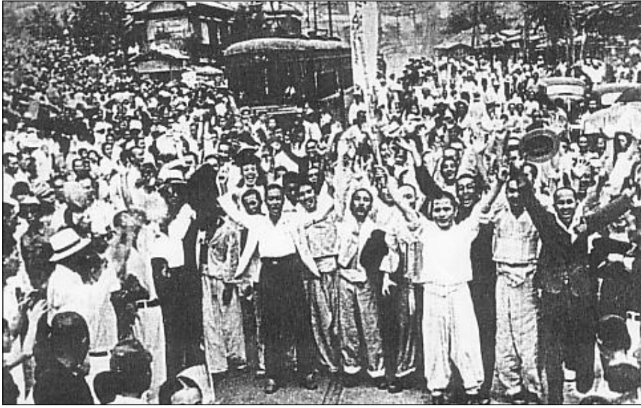
Korean independence activists are released in 1945 after the declaration of liberation.

Story by Cpl. Lee, Kyoung-yoon USAG Yongsan Public Affairs