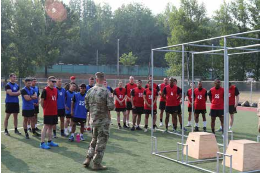
6th Ordnance Battalion soldiers receive instructions prior to the chin-up event for the German Armed Forces Proficiency Badge test held in Camp Carroll, South Korea June 21 and 22.