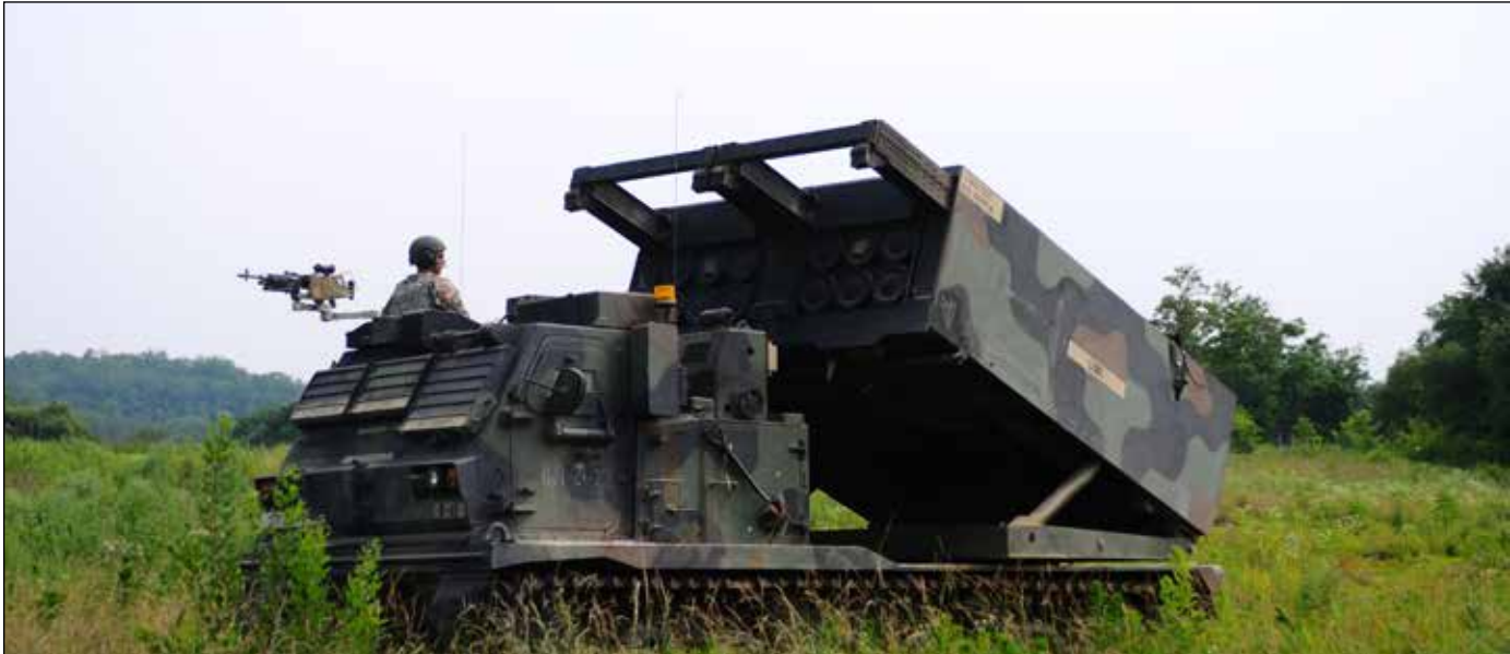
An M270 Multiple Launch Rocket System is in position during a training exercise in Paju June 20. The launcher is part of Battery B, 6th Battalion, 37th Field Artillery Regiment, 210th Field Artillery Brigade, part of the 2nd Infantry Division/ROK-US Combined Division.