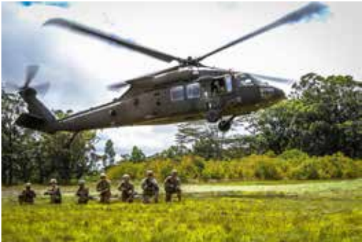
Competitors of the Best Warrior competition pull security for the UH-60 Blackhawk after landing for their land navigation exercise on Day 2 of the Pacific Theater Best Warrior Competition, June 13, at Schofield Barracks, Hawaii. The contest will determine who is the best Soldier and Noncommissioned Officer in the Pacific.