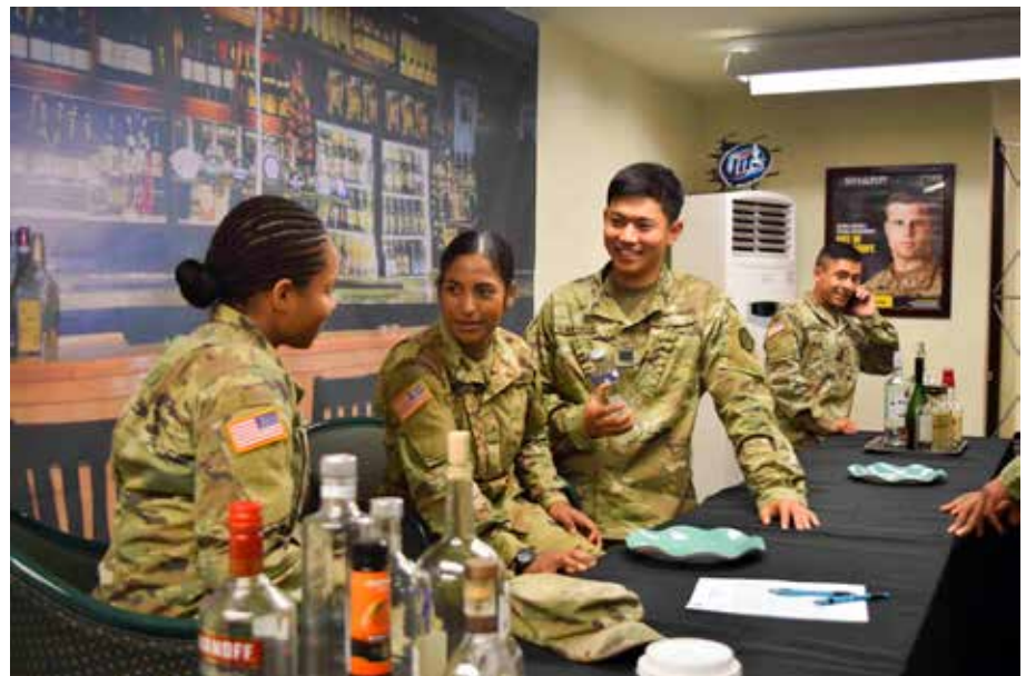
Soldiers participate in roleplaying at a bar scene during the SHARP 360 face-to-face training, June 21, at the Camp Walker SHARP 360 building.

The Area IV SHARP 360 facility was designed and built as a concept in the Republic of Korea. The training has