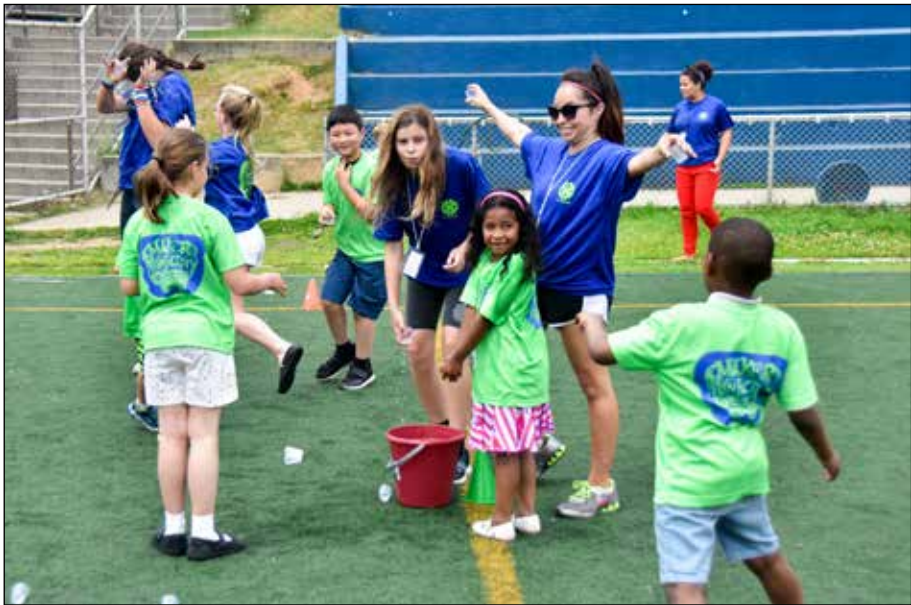
Children and volunteers of the 2017 Summer Vacation Bible School play games June 19, on the Seoul American High School Field.