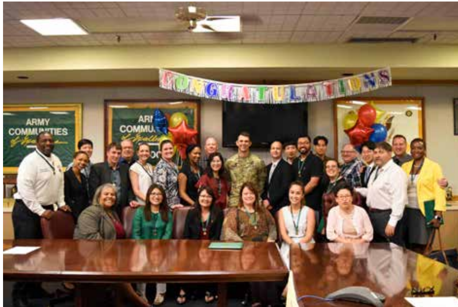
Participants of "Emerging Leaders Creating Unity by Engagement" 2017 pose for a group photo during the EL CUBE graduation ceremony, June 28, at the USAG Daegu command conference room.

"I am completely impressed by your dedication and abil-