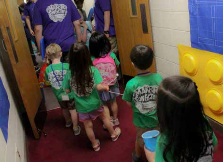
A small group of children attending the Area IV Vacation Bible School, held June 19-23, move to a different activity zone led by a volunteer at Camp Walker Soldiers Memorial Chapel.