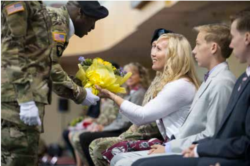
Change of Command from page 1