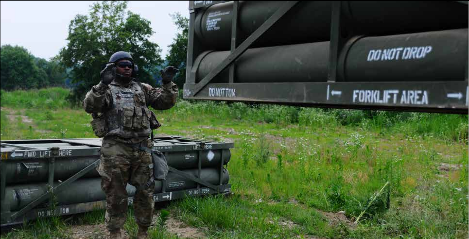
During a rocket artillery training exercise in Paju, June 20, a Soldier helps load rockets onto an M270 Multiple Launch Rocket System (MLRS). The Soldier is assigned to Battery B, 6th Battalion, 37th Field Artillery Regiment, 210th Field Artillery Brigade, part of the 2nd Infantry Division/ROK-US Combined Division. The battery was taking part in training that helped Soldiers hone their skills in responding to fire missions in a variety of realistic scenarios.