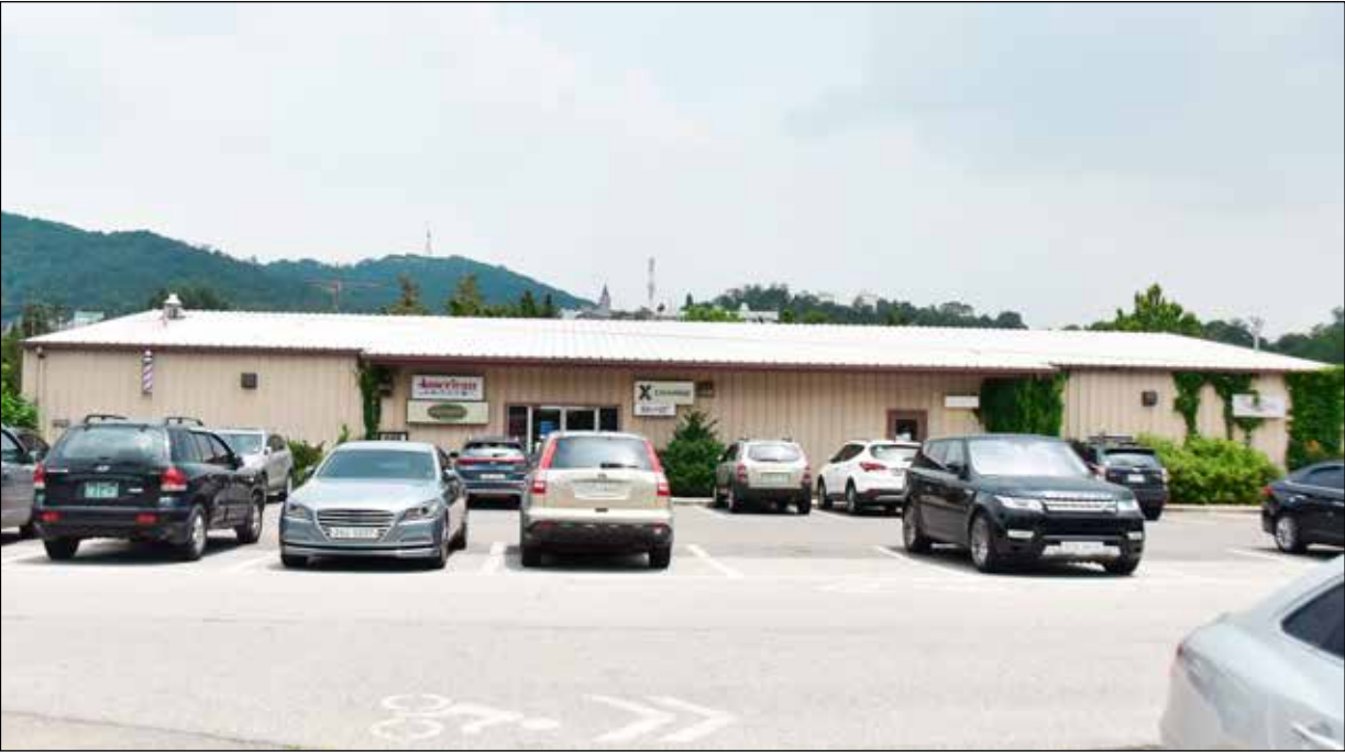
Camp Coiner AAFES stores closed June 30 as a result of the transformation of U.S. Army Garrison Yongsan. The bike shop will remain open until November.