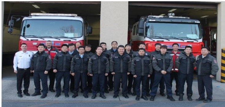
Camp Walker, Fire Station #1