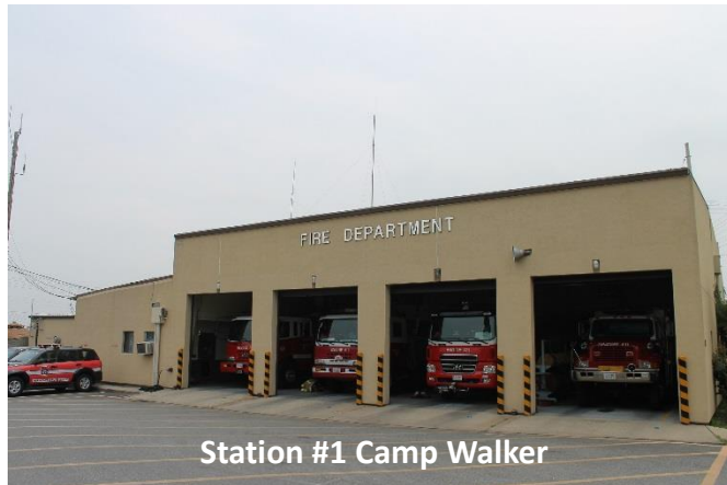
Station #1 Camp Walker

Camp Walker & Camp Henry Assistant Chief's 315-764-5902