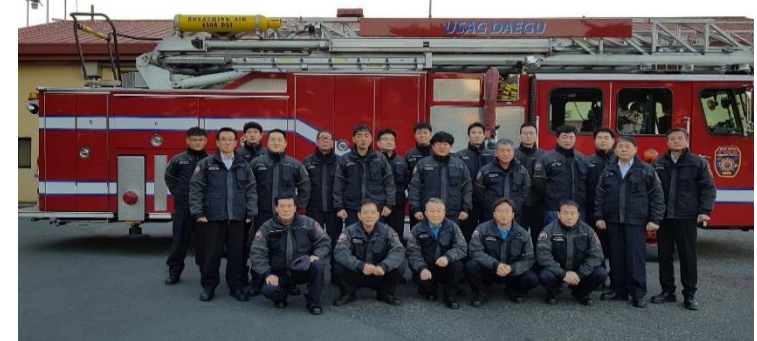
Camp Carroll, Fire Station #3