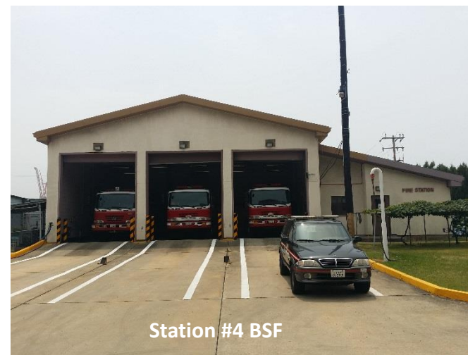
Station #4 BSF