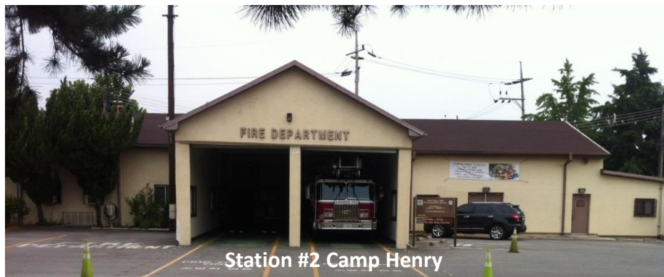
Station #2 Camp Henry