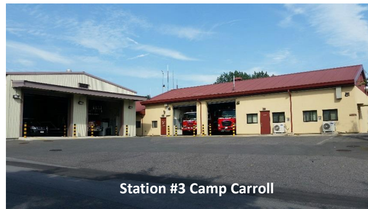
Station #3 Camp Carroll

Camp Carroll Assistant Chief's 315-765-7190