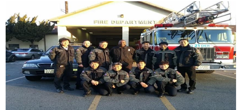
Camp Henry, Fire Station #2