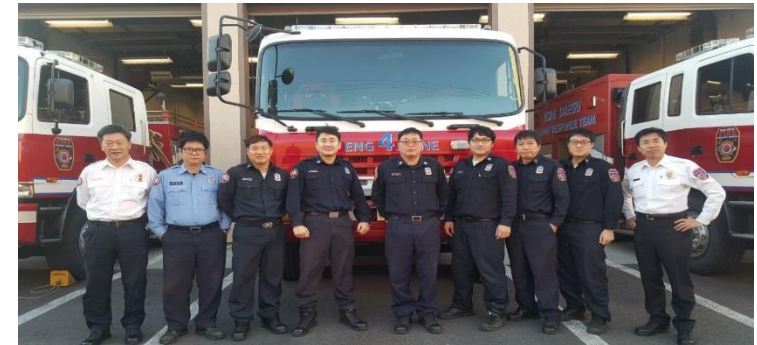
Busan Storage Center, Fire Station #4