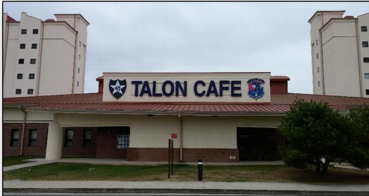
Talon Café Renovation