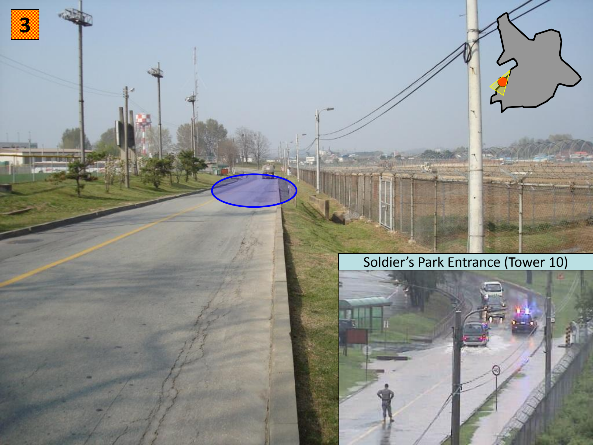
Soldier's Park Entrance (Tower 10)