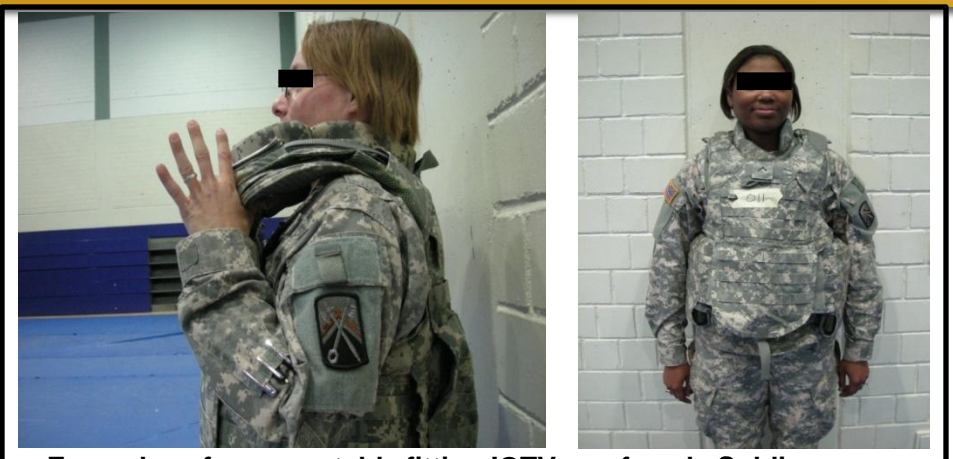
Examples of unacceptable fitting IOTVs on female Soldiers