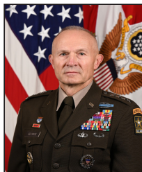
CHIEF OF STAFF OF THE ARMY GEN Randy A. George