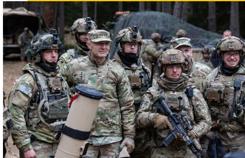
GEN Randy George, Chief of Staff of the Army, visits the Joint Multinational Readiness Center to talk with Soldiers participating in exercise Combined Resolve 25-1.