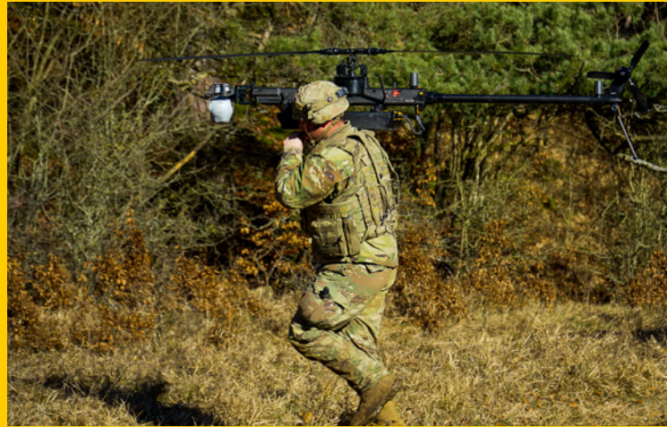
U.S. Army Soldier assigned to the 3rd Brigade, 10th Mountain Division carries a GhostX drone after completing a successful flight mission during exercise Combined Resolve 25-1 at Hohenfels Training Area on 31 January 2025.

The lessons learned from these rotations at JMRC are invaluable for shaping future military doctrine and ensuring forces are prepared to face evolving threats on the modern battlefield. The emphasis on integrating advanced technology, fostering multinational partnerships, and adapting tactics will be crucial for maintaining a competitive edge in an increasingly complex security environment.