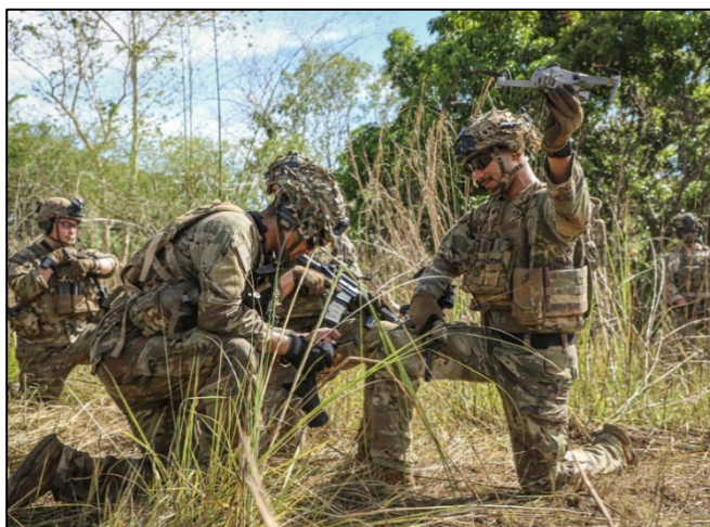
Figure 1. U.S. Army Soldiers assigned to 2nd Battalion, 27th Infantry Regiment, 3rd Infantry Brigade Combat Team, 25th Infantry Division, alongside Philippine Army's 7th Infantry Division soldiers, conduct a live-fire exercise during Salaknib 24, 13 May 2024.

Ongoing 25th ID efforts to experiment with robotics and drone technology showcased the potential for these tools to enhance Soldier safety and effectiveness on the battlefield and has a direct impact on organizational attitudes toward risk. Proactive experimentation in techcraft, achieved through a broadened risk tolerance, directly results in developing and refining new tactics and procedures, which leverage emerging technologies. Ultimately, deploying technology further reduces expenses every leader tries to prevent, which is the loss of Soldiers' lives. When they have the authority, leaders must underwrite risk that allows for techcraft and innovation to flourish on installations and in training.