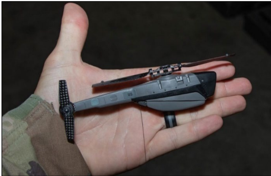
Figure 2. Soldiers assigned to 3rd Infantry Brigade Combat Team, 25th Infantry Division participate in modernization efforts through new equipment fielding on Schofield Barracks, HI. Some of the equipment fielded included a new vision goggle system, pistol aiming laser, and a very small unmanned aerial vehicle.

Effective communication and collaboration are elements in inspiring a culture of innovation and adaptation. Leaders creating channels for sharing ideas, encouraging diverse perspectives, and leveraging real-world feedback can set unit culture and norms into an optimal state to enhance readiness and effectiveness in an evolving landscape of warfare.