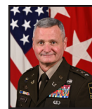
JUDGE ADVOCATE GENERAL LTG Joseph B. Berger, III