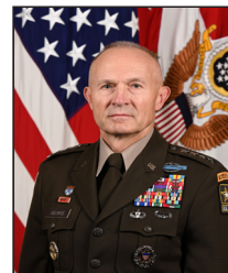
CHIEF OF STAFF OF THE ARMY GEN Randy A. George