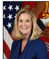
SECRETARY OF THE ARMY HON Christine E. Wormuth