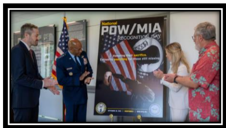
Unveiling of this year’s National POW/MIA Recognition Day Poster at the Pentagon.