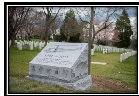
Arlington National Cemetery Tram Tour

Last month, in Issue 9 , we invited you to join us on a Vietnam War themed tour in collaboration with Arlington National Cemetery (ANC). This special tour will be held Friday, September 27 at 11 a.m. , and will visit five grave sites, the Vietnam Helicopter Association Memorial, the Tomb of the Unknown Soldier, the Memorial Amphitheater Display Room exhibit revealing Vietnam War artifacts, and will also include a viewing of the Changing of the Guard. The tour is free , but does require registration. Visit ANC's tour site for more information and to register!