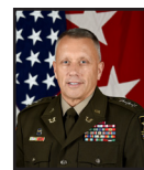
JUDGE ADVOCATE GENERAL LTG Stuart W. Risch