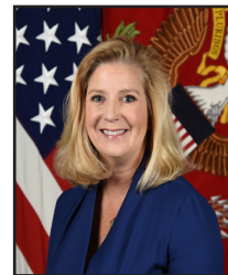
SECRETARY OF THE ARMY Honorable Christine E. Wormuth