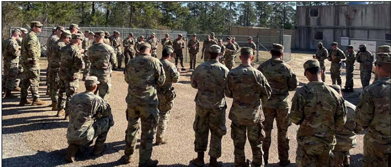
Figure 2. NCOs from 2-4 IN conduct a two-day, off-site leader professional development and training event to build cohesive teams and make them more lethal on the battlefield.

Senior leaders in any organization must constantly maintain a leader development program. See figure 2. An optimal leader development program provides knowledge and skills to subordinates, which is the best way of distilling lessons from the operational domain, in turn reinforcing the institutional and self-development domains. 1 Optimal programs provide subordinates with topics focused on organizational and individual success and establishing fundamentals are an important pathway for achieving that success. Organizations I was a part of employed a “big five” that focused on fundamentals of marksmanship, small-unit drill, communication, combat casualty care, and physical fitness; however, you must give thought to the topics at echelon. An organization’s “big five” should focus on the audience and the organization’s needs. For senior-ranking populations, discussions of tactics, techniques, and procedures and being a good steward of the profession can contribute to organizational objectives.