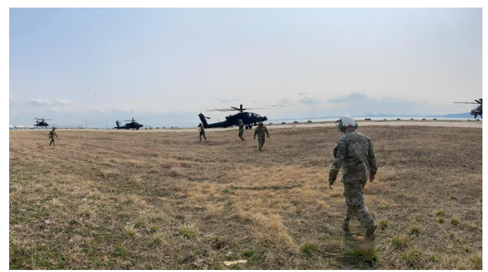
U.S. Army ground crews from 4-2 Attack Battalion, 2nd Combat Aviation Brigade, 2nd Infantry-ROK/U.S. Combined Division, observe as AH-64 pilots prepare to take off for Maritime Counter Special Operations Forces Training with ROK 2nd Fleet during Freedom Shield 2024. FS24, a defense-oriented exercise, fortifies joint defense capabilities, and safeguards security on the peninsula.