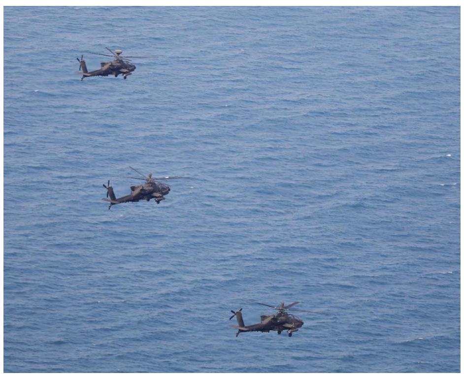
U.S. Army AH-64 helicopters from 4-2 Attack Battalion, 2nd Combat Aviation Brigade, 2nd Infantry-ROK/U.S. Combined Division, conduct overwater gunnery in coordination with ROK 2nd Fleet during Freedom Shield 2024. FS24, a defense-oriented exercise, fortifies joint defense capabilities, and safeguards security on the peninsula.