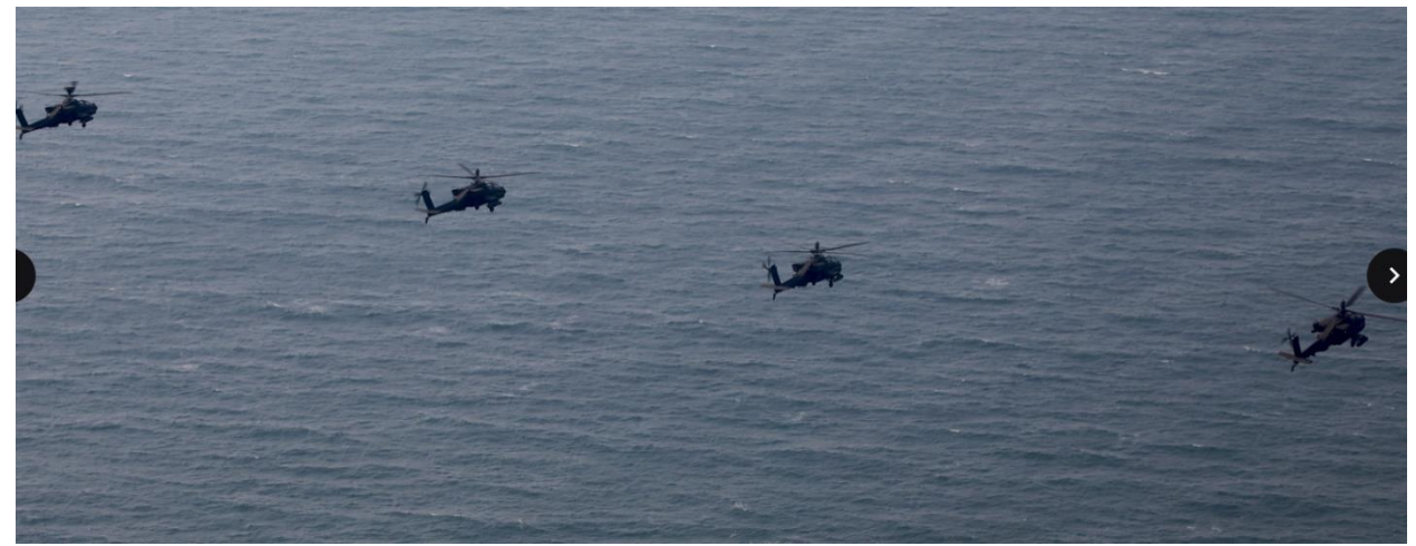
U.S. Army AH-64 helicopters from 4-2 Attack Battalion, 2nd Combat Aviation Brigade, 2nd Infantry-ROK/U.S. Combined Division, move into an attack formation for overwater gunnery in coordination with ROK 2nd Fleet during Freedom Shield 2024. FS24, a defense-oriented exercise, fortifies joint defense capabilities, and safeguards security on the peninsula.

For more information, contact the Eighth Army public affairs office at 0503-355-8266 or 010-2295-2192.