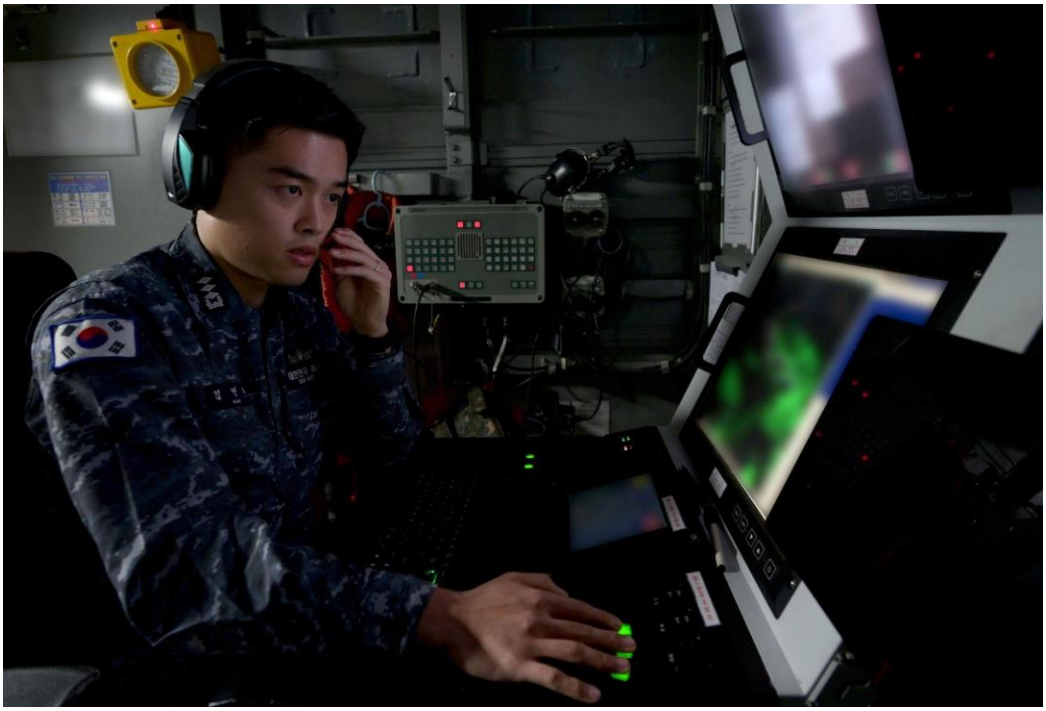
An operations officer of the ROK Navy 2nd Fleet guides a U.S.4-2 Attack Battalion Apache helicopter for Marine Counter Special Operation Force training in the West Sea, Mar. 4, 2024.

Freedom Shield is an annual combined exercise conducted in support of the ROK-US Mutual Defense Treaty signed Oct. 1, 1953. This combined exercise program highlights the ironclad commitment between the two nations to maintain a robust combined posture to defend the people of the ROK and its sovereignty from any threat or adversary. The exercise is not associated with any current real-world situation.