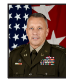
JUDGE ADVOCATE GENERAL LTG Stuart W. Risch