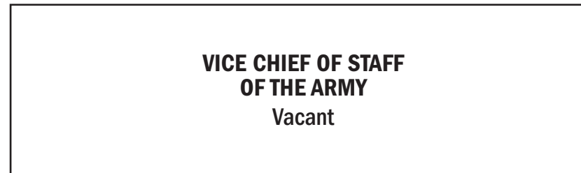
VICE CHIEF OF STAFF OF THE ARMY Vacant