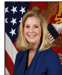
SECRETARY OF THE ARMY Honorable Christine E. Wormuth