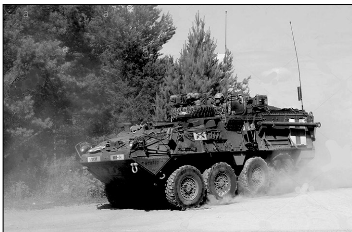
Figure 1. U.S. Soldiers aboard an M1133 medical evacuation vehicle assigned to the 1st Squadron, 2nd Cavalry Regiment, Battle Group Poland, moving in a defensive position during Exercise SABER STRIKE 18 in Bemowo Piskie Training Area, Poland, 12 June 2018. Exercise SABER STRIKE is a U.S. European Command-sponsored, Joint Chiefs of Staff-directed, regional and multilateral command post and field exercise designed to increase interoperability between the U.S. and partner nations.

The multinational PECC in Szczecin, Poland, coordinated evacuation among hospitals until Service members were repatriated. Repatriation is defined as a Service member returning to home station or higher echelons of care from host-nation hospitalization. The PECC consisted of an Officer (OF)-5 (U.S. Army equivalent of a colonel) German multinational lead physician, OF-4 (U.S. Army equivalent of a lieutenant colonel) shift lead, two OF-3s (U.S. Army equivalent of a major) PECC operations officers, two OF-3 U.K. officers, two OF-3 Polish PECC officers, two senior noncommissioned officers for administrative support, and a U.S. Army combat medic specialist. In order to track repatriated patients, U.S. Army Europe (USAREUR) tasked the 30th Medical Brigade to form a patient movement cell to regulate patient evacuation from the point of injury to host-nation hospital care facilities and to provide a medical common operational picture (MEDCOP) of the patients' status. The multinational PECC focused on regulating U.S. and multinational casualties. It provided Multinational Corps Northeast the MEDCOP of the U.S. and multinational forces admitted as inpatients (patients with a hospital stay greater than 24 hours).