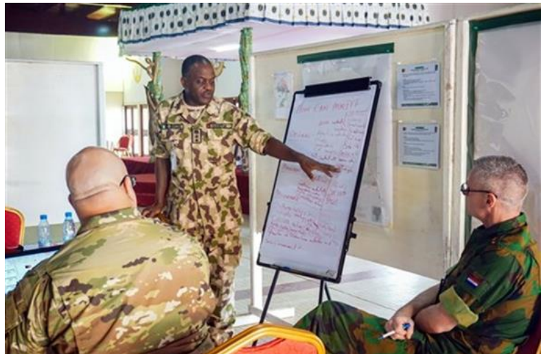
Planners discuss multinational interorganizational cooperation during Exercise United Focus, 26 April 2017.

Noncommissioned officers (NCOs) should also be exposed to the capabilities of the interagency and NGO partners as part of the NCO Education System. Like the officer development, the education begins with explaining the USG organizations and their capabilities as instruments of national power (diplomatic, informational, military and economic) in the basic leader's course and advanced leader's course. Integrating the joint, interagency perspective with intergovernmental and multinational, including NGO, organizations these young leaders will encounter, provides an understanding of their operating environment. Education continues with the integration of interagency and NGO personnel in the U.S. Army Sergeants Major Academy during joint exercise planning modules.