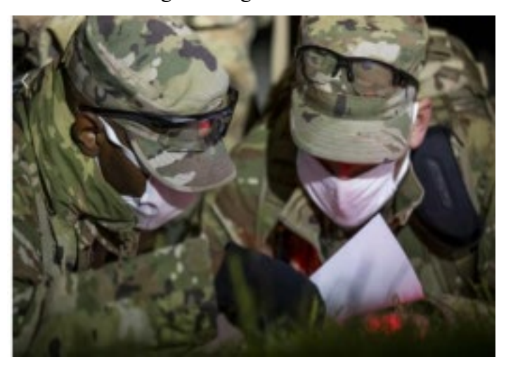
Figure 1: Soldiers Training at the United States Army Reserve Best Warrior Competition<sup>6</sup>

Fifth, commanders were directed to employ risk-mitigation strategies throughout their training at Fort McCoy and to minimize non-essential face-to-face interaction or transactions with the garrison and tenant workforce. Special emphasis was on unit movement, billeting, sanitation, feeding, and laundry operations. CDC guidelines and other general health information relating to reducing the risk of contracting COVID-19 were included in the policy as separate enclosures. Figure 1 depicts Soldiers training during COVID-19 conditions.