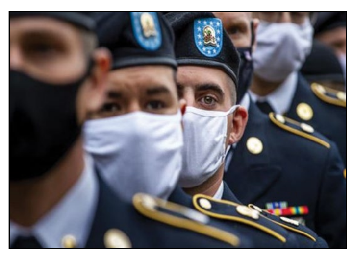
Figure 2: United States Army Reserve Best Warrior Competition Graduation Ceremony<sup>6</sup>

Finally, the policy also stipulated the types of services and support the garrison would provide to units such as billeting, isolation facilities, emergency medical evacuation services, hand-wash stations, limited quantities of personal protective equipment, and facilities service orders (i.e., facility maintenance requests, roads and grounds management, pest management, refuse collection and recycling, portable latrine and sink provisions, etc.). Figure 2 depicts the Best Warrior Competition graduation ceremony.