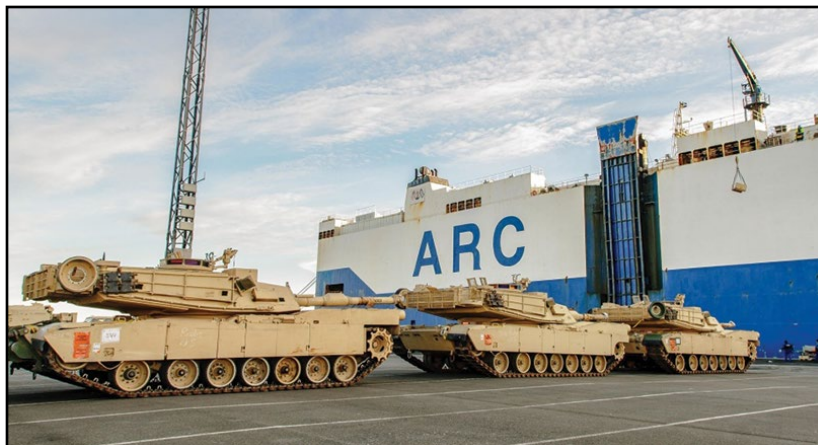
Figure 3-1. M1A2 Abrams tanks and other military vehicles from 3rd Armored Brigade Combat Team (ABCT)/4th Infantry Division (ID), Fort Carson, CO, are unloaded off the ARC Resolve at the port in Bremerhaven, Germany, 06 JAN 2017.

Vessel loading commenced at Beaumont, TX, from about 14-23 DEC 2016. A winter storm delayed the upload on one vessel, but proactive use of additional shifts and hard work by the 842nd ensured all vessels departed in time to meet the desired arrival and discharge dates at the SPOD. 842nd personnel annotated on the vessel manifests all vehicles that had to be towed on-board. They also reported a high number of vehicles had low fuel levels, but this did not happen until after the vessels sailed. Low fuel levels caused significant issues at destination, and action has been taken to eliminate this issue for future home station deployment platforms.