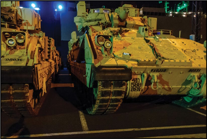
Figure 1-2. A group of Army Bradley Fighting Vehicles from 3rd ABCT/4th ID, wait to be loaded onto a railcar for shipment to Poland at the port in Bremerhaven, Germany, 7 JAN 2017.

the mechanism to submit movement requirements to lift providers in the form of time-phased force and deployment data (TPFDD). The TPFDD is both a force and a transportation requirements document. 9