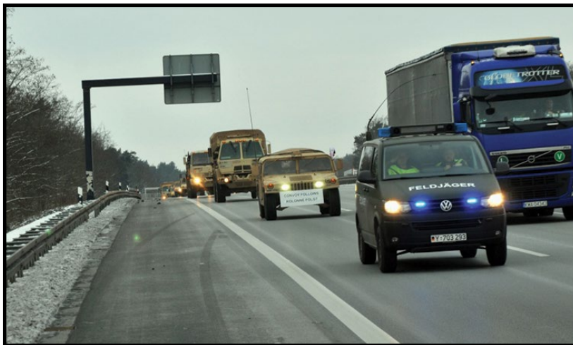
Figure 1-4. German military police officers assist 3rd ABCT/4th ID Soldiers in Oberlausitz, Germany, during their third day of convoying to Poland.

it is not positioned to capture movement of cargo out of the ISB area. The interrogator is positioned in a location in the port area too far from ISB, by HN agreement, where U.S. unit deployment cargo is discharged. This positioning does not adequately facilitate the process.