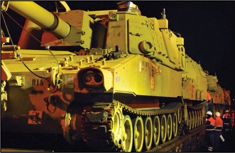
Figure 3-2. Army M109A6 Paladins and M992A2 Field Artillery Ammunition Supply Vehicles sit on a railhead waiting to be transported to Poland, 06 JAN 2017, at Bremerhaven Seaport in support of OAR. direct delivery and pre-planned line haul could have sped up the discharge and onward movement process while reducing rail loading delays.

The ABCT planned for a single convoy to travel the entire route into Poland and planned to convoy light rolling stock to Bergen-Hohne for rail load. The most obvious issue was the unit removed and stored all its vehicle soft-tops and basic issue items (BII). The unit conducting the single convoy provided the container number where its tops and BII were stored, and the battalion located the equipment and had it discharged from the ship in time for the unit to execute the mission. The remainder of the soft-topped vehicles destined to Bergen-Hohne had to be line-hauled, rather than driven to the inland rail site. This consumed a considerable amount of time and effort, and committed the 21st TSC's full line-haul capacity for several days. Despite the setback, rail operations from the inland railhead were a resounding success, and could have been utilized to further reduce strain on SPOD rail capacity. Rail operations at Bergen-Hohne for future operations should be expanded to include heavy wheeled vehicles and possibly light tracks [M113 (field of view (FOV))].