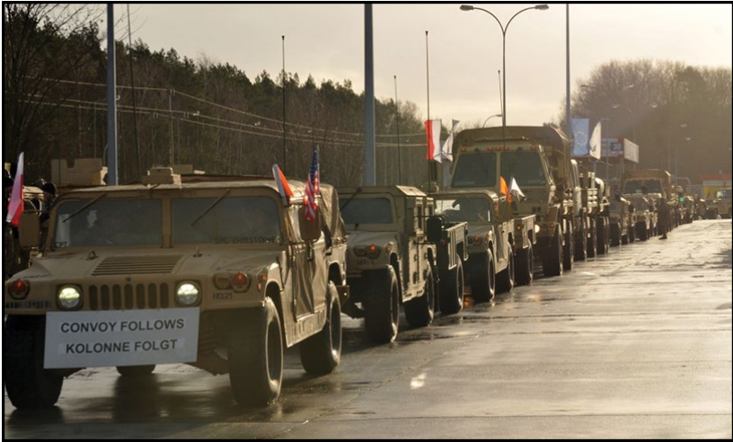
Figure 1-3. 3rd ABCT/4th ID stages its vehicles after officially crossing into Poland from Germany after conducting a three-day convoy, 12 JAN 2017, for its nine-month deployment training alongside multinational partners.