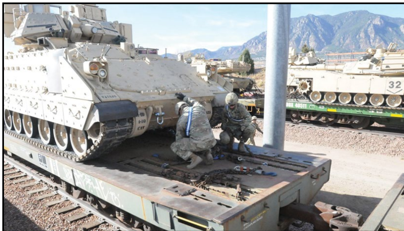
Figure 1-1. An M2A3 Bradley fighting vehicle crew from Apache Troop, 4th Squadron/10th Cavalry Regiment, 3rd ABCT/4th ID, secures its vehicle to a rail car at Fort Carson, CO, 15 NOV 2016.