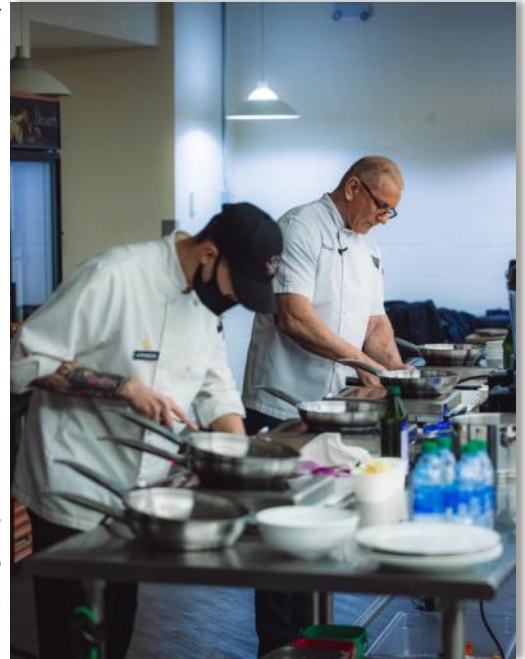
Celebrity Chef Robert Irvine provides instruction to Army Culinary Specialists while at JBLM.

https://www.ksre.k-state.edu/news/stories/2020/10/cooking-at-home-during-the-pandemic