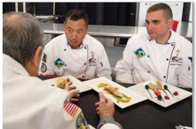
FCCO Culinarians receive a critique on items prepared.