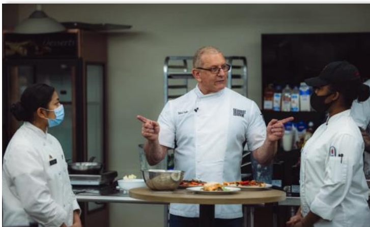
Celebrity Chef Robert Irvine provides Civilian Industry techniques to enhance Warrior Restaurants.

The intent of the Adopt-a-Chef Program is a local program that is zero-cost to the installation/organization. Civilian industry agencies and their personnel who participate in this program understand that they are volunteering their time, knowledge, and experience to assist in improving the Army Food Program. A Gratuitous Service Agreement must be completed by the Army representative (Recipient) of the gratuitous services prior to any services being rendered. Institutionally trained chefs certified through a comprehensive certification program must coordinate with the Installation Food Program Manager and Food Advisor to establish program parameters and execution plans. The Adopt-a-Chef program supports the Army 92G Credentialing Program.