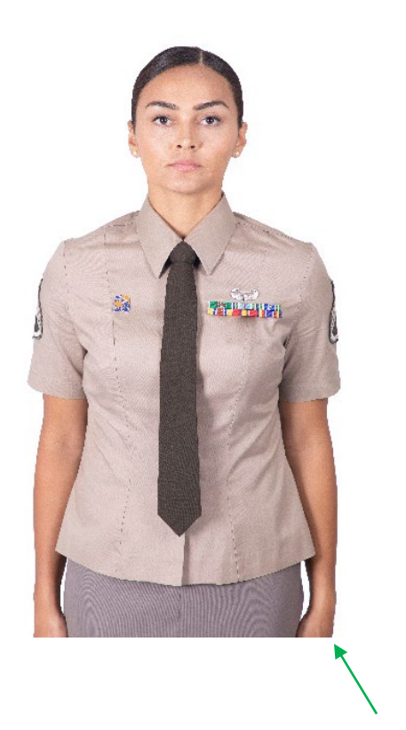
*With insignia and accoutrements