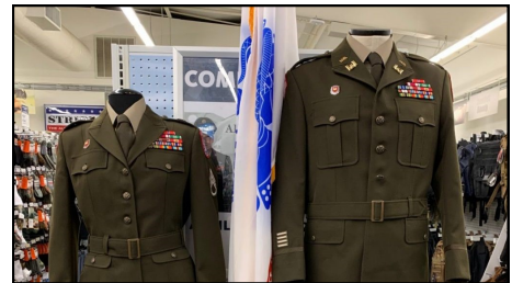
Photo Contest: In December, Army G-4 hosted the inaugural U.S. Army Logistics Photo Contest. More than 200 photos were submitted for consideration. The winners, announced in early January, follow:

Army Greens Availability: Fielding of the Army Green Service Uniform (AGSU) continues. AGSUs are currently available at AAFES locations in Ft. Knox, KY; Ft. Sill, OK; Ft. Benning, GA; Ft. Leonard Wood, MO; Ft. Jackson, SC; National Capital Region; Rock Island Arsenal, IL; Joint Base San Antonio, TX; Ft. Lee, VA; Redstone Arsenal, AL; West Point, NY; Ft. Drum, NY; Ft. Eustis, VA; Ft. Gordon, GA; Ft. Campbell, KY; Ft. Bragg, NC; Ft. Hood, TX; Ft. Bliss, TX; Joint Base Lewis-McChord, WA; and, Ft. Carson, CO. Fielding at remaining installations is estimated to be completed by June 2021.